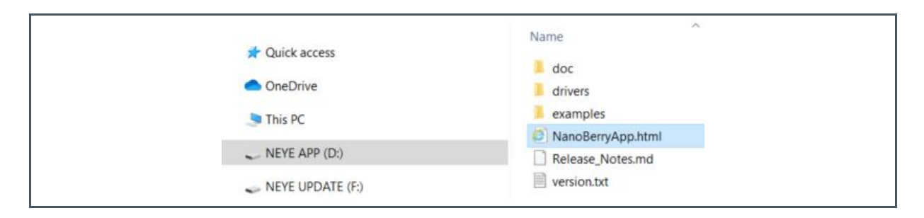
Figure 3: Drives Mounted on PC

Further help and instructions are in the Release_Notes file.md. (it can be opened in any text editor).