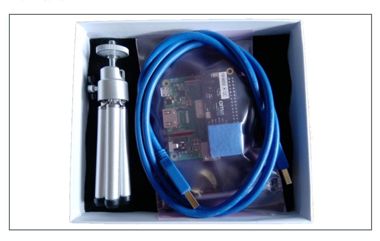
Figure 1: Eval Kit Content