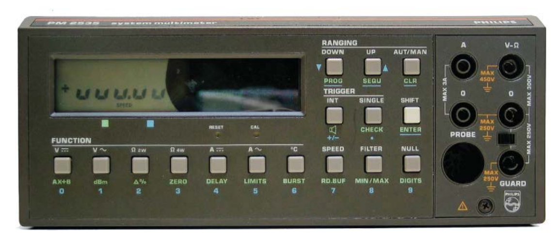
Figure 4. The meter with the defective display, which was beyond repair.