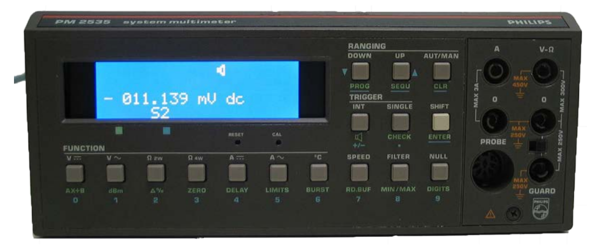
Figure 5. The meter with the repaired display.